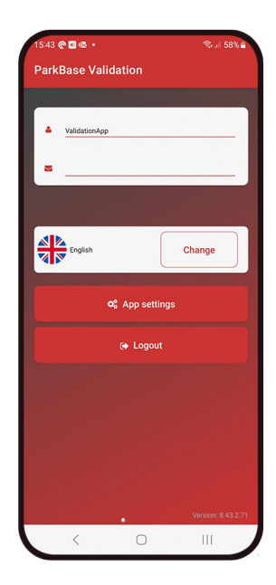
Step 1 Log in

Through the ParkBase Validation app, the administrative burden and distribution of physical tickets is eliminated. This sets up the ideal environment to create loyalty systems with local companies, such as shopping centers, restaurants, cinemas and theaters. For example, if you manage a facility close to a shopping center, retailers can offer their customers discounted parking at their expense with validation through the ParkBase Validation app.