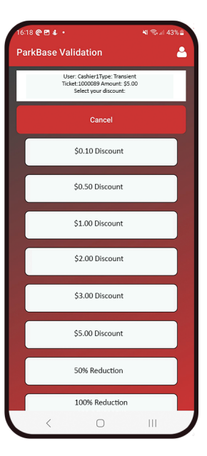
Step 3 Make your choice