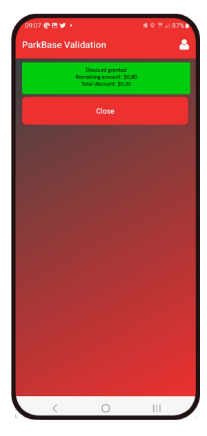
Step 4 Confirmation of processing in ParkBase